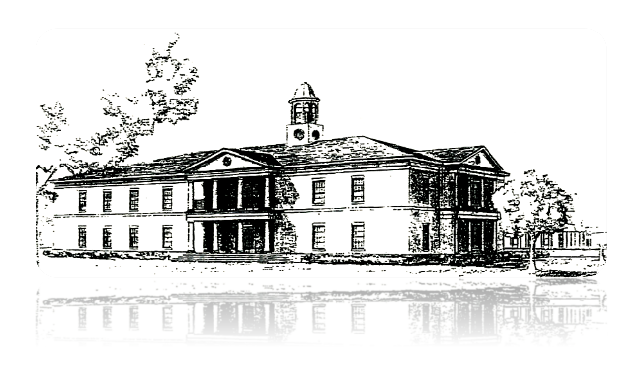
Integrating Faith in Learning, Leading, and Serving Charleston Southern University