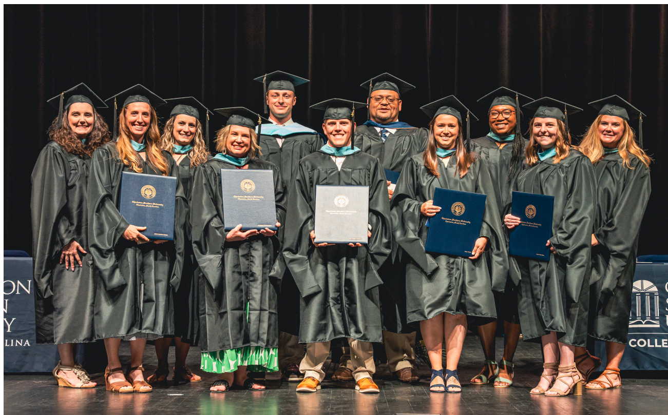
Class of May 2023